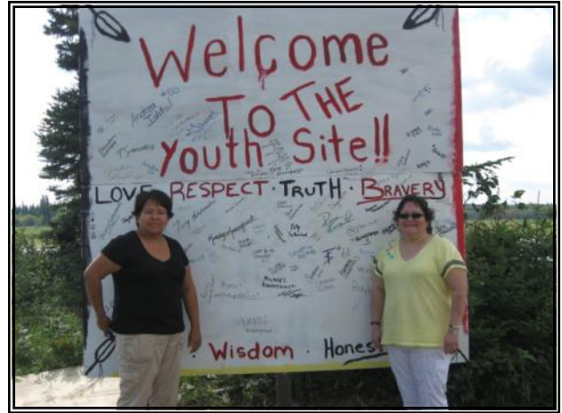
In Kashechewan First Nation